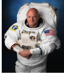
Captain Scott Kelly U.S. Astronaut and Retired U.S. Navy Captain