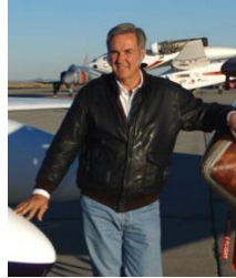
Burt Rutan Aerospace Legend